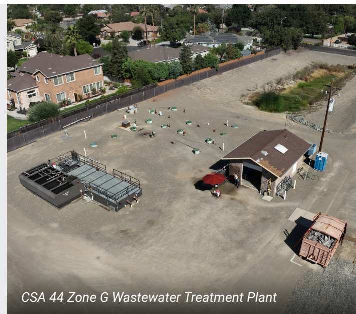
CSA 44 Zone G Wastewater Treatment Plant