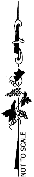
ANGLE AND DISTANCE TABLE