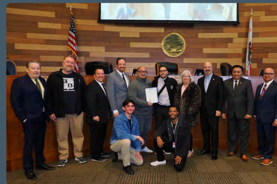
Students and instructors from Codestack Academy joined us in the Board Chambers to tell us more about their program.