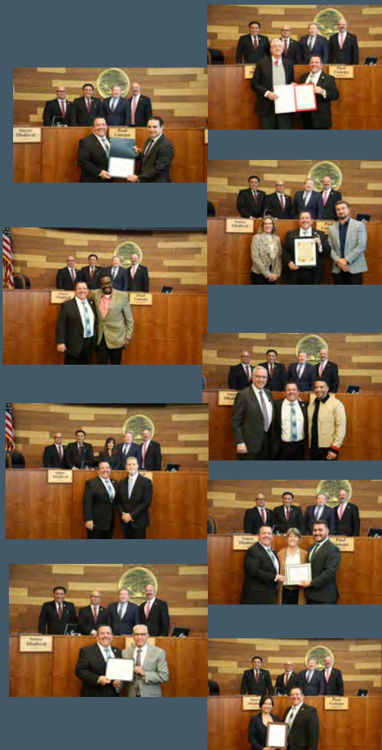
Thank you to local elected officials and city partners who came to celebrate with us!