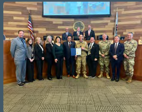
Representatives from SJCCE and the California National Guard were joined by a future graduate of Discovery Challenge Academy to highlight their work with at-risk youth.