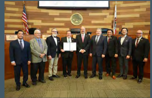
Former Board members joined the Board of Supervisors at the 175th anniversary kick-off event, held in the Board Chambers in late January.

(Thank you to the San Joaquin County Historical Museum for their partnership on this project. Photo credits for all of the historical pictures included in the newsletter goes to them.)